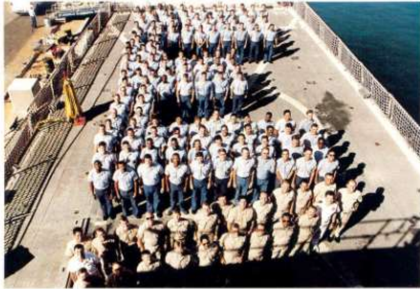
A WINNING CREW GOING OUT IN STYLE